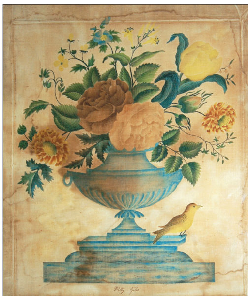
Dating to c. 1830, this watercolor theorem on velvet is signed "Polly Giles."

In other types of stenciling, one color is used per stencil and usually there are spaces of plain background between the different colors in the finished work. For theorem painting, one stencil has elements of different parts of the subject—for example, a few petals of a single flower—rather than the whole shape, and several colors may