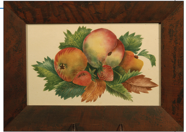
This fine example of a theorem painting—a watercolor on paper—dates to c. 1840.

Embroidered pictures, however, were time-consuming and expensive to make. The theorem technique of painting allowed even unskilled folks to quickly create professional-looking pictures to decorate their own homes or to give as gifts. Velvet painting, as it was first called, became a fashion and even a fad. As Antiques Roadshow appraiser J. Michael Flanigan comments, the original paint-by-the-numbers artwork was born.